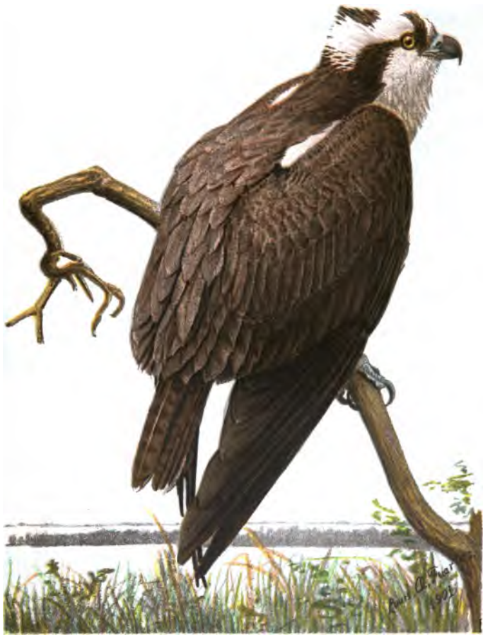
AMERICAN OSPREY OR FISH HAWK